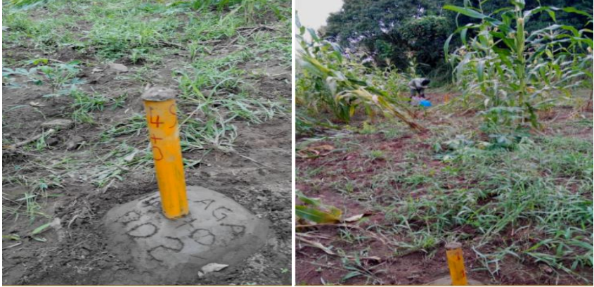
Figure 6: The Pegging of a Tower Center Point and its Offset Points

The pegging pegging of the set out location is usually done with a quarter inch pipe of 70cm length, paint with yellow colour with 40cm driven to the ground. The pipe is filled with concrete. Every Tower Pegs is embedded with the company name, tower number and tower type. The Right of Way (ROW) of 15m from the center line should also be establish using concrete pillars.