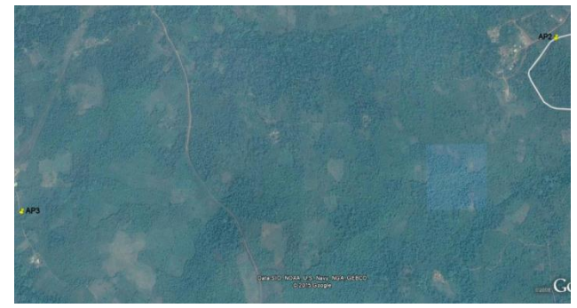
Figure 2: Slide 1 of the Satelite imagery showing some prominent features and AP0 to AP2

Figure3: Slide 2 of the Satelite Imagery showing AP2 to AP3