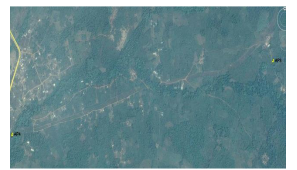
Figure 4: Slide 3 of the Satelite Imagery showing AP3 to AP4

The following are the metadata of the imagery: