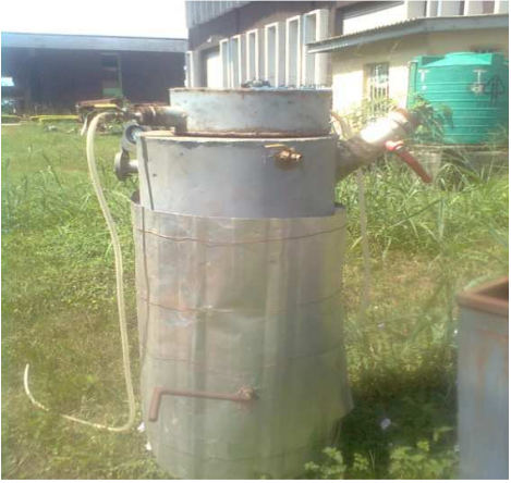
Fig. 2: Locally made biogas digester Ref: [11].

The various components listed in association with their joining fittings were used to fabricate the digester. Fig. 2 shows the fabricated design